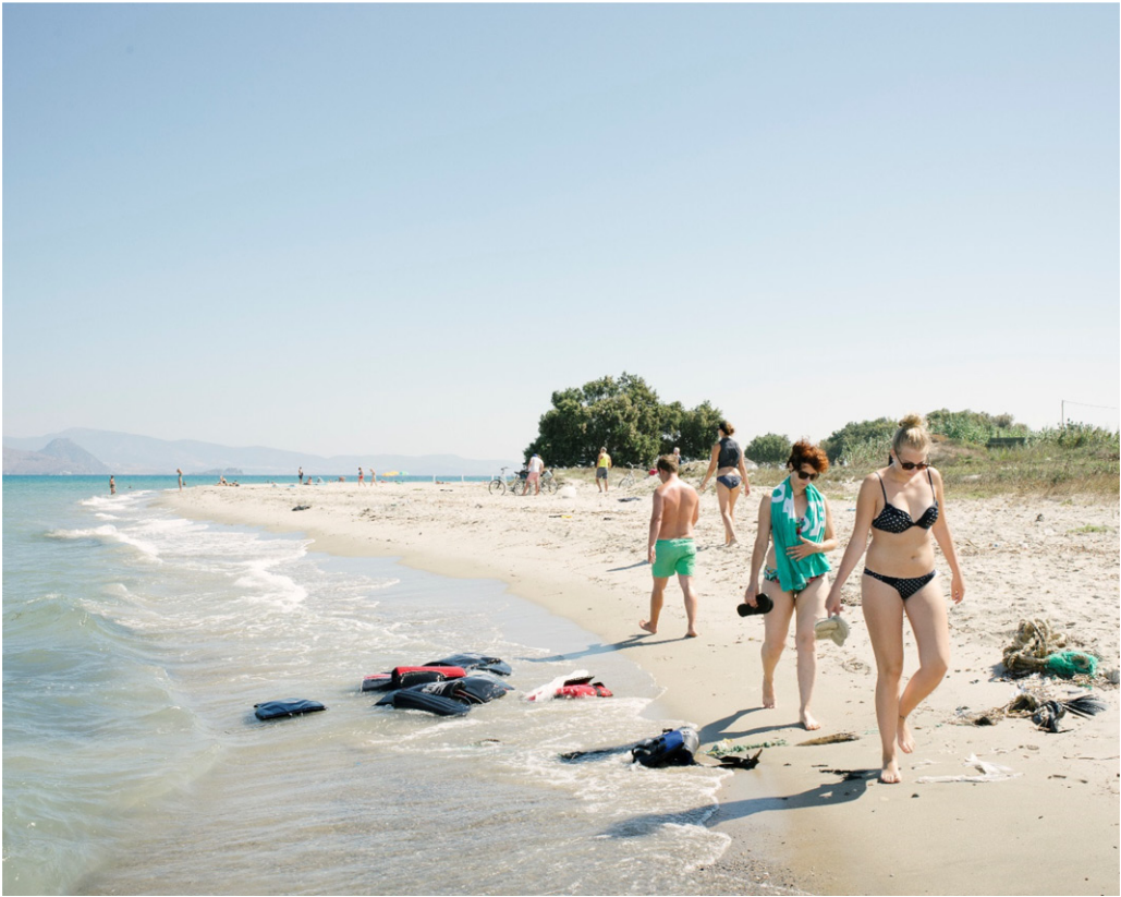
Figure 1. Photo from “Tourists versus Refugees series, “Tourists taking a morning walk at the beach pass by abandoned life-jackets from refugees that arrived on the previous night,” August 2015, Kos, Greece.

What the Spanish media dubbed turismofobia overtook several European cities last summer [...] But in contrast to many, as fiercely as Barcelona has pushed back against tourists, it has campaigned to welcome more refugees. When news broke two weeks ago that a rescue ship carrying 629 migrants was adrift in the Mediterranean, mayor Ada Colau was among the first to offer those aboard safe haven (Borgen, 2018).