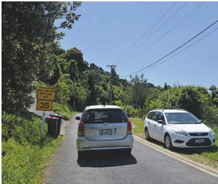
A new forum is being established to encourage residents to discuss solutions to transport-related issues.